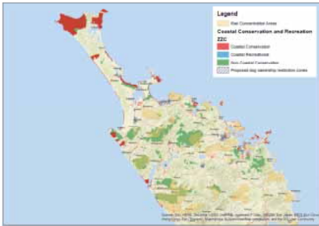
Document number A1782476

The Dog Policy and Bylaw Schedule is summarised in the map below. More detailed maps will be made available on the Council's website.